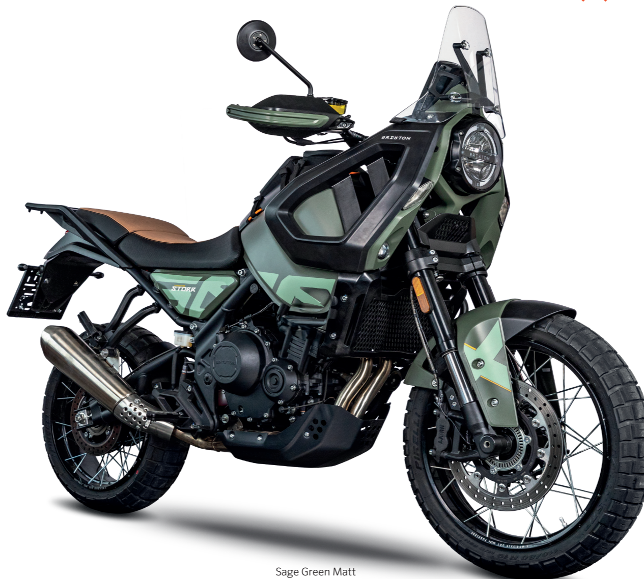
Sage Green Matt