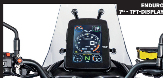
ENDURO 7" - TFT-DISPLAY